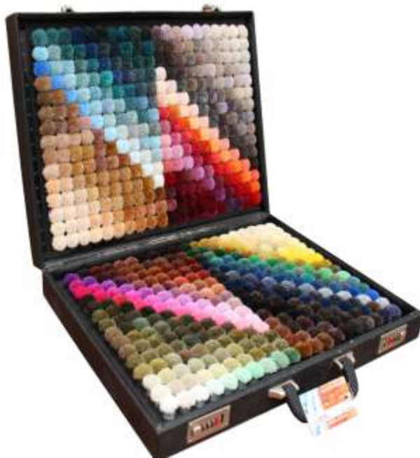
600 SHADES IN PET